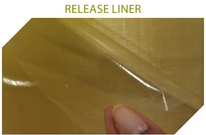
Clear release liner must be removed before use.